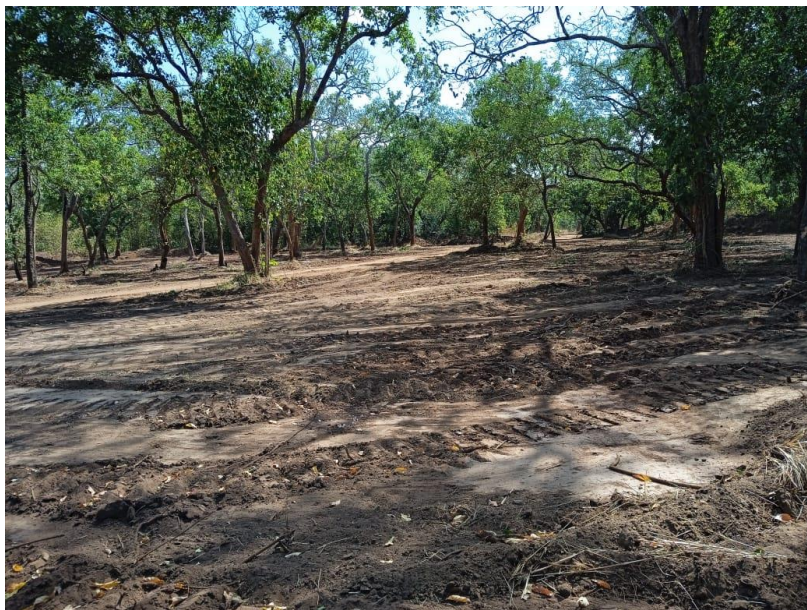
Area cleared for the construction fly camp

Following the completion of the earth works for the reinstatement of the project access road (18km) and internal access roads (25km), earthworks for the proposed construction project fly camp and laydown area were completed. This will allow easy light vehicle and small truck access, along with improved management of site security and safety.